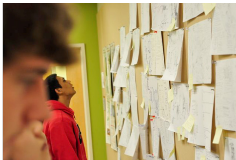
Georgia Institute of Technology