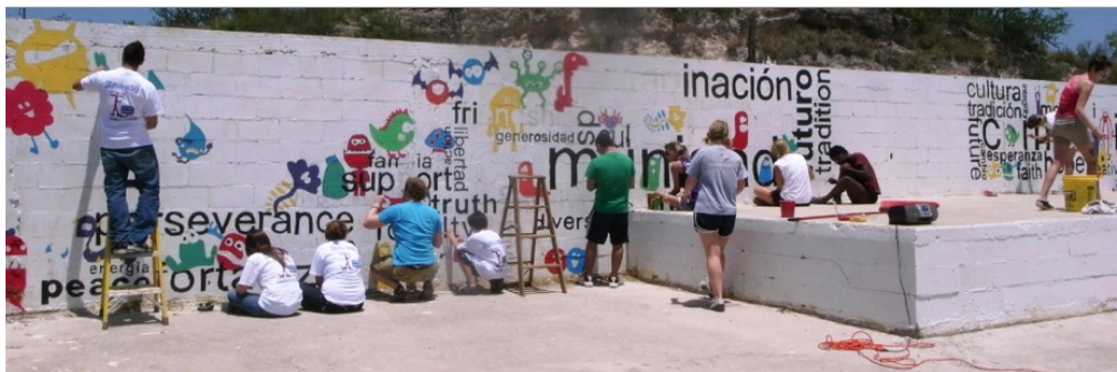
Texas A&M University