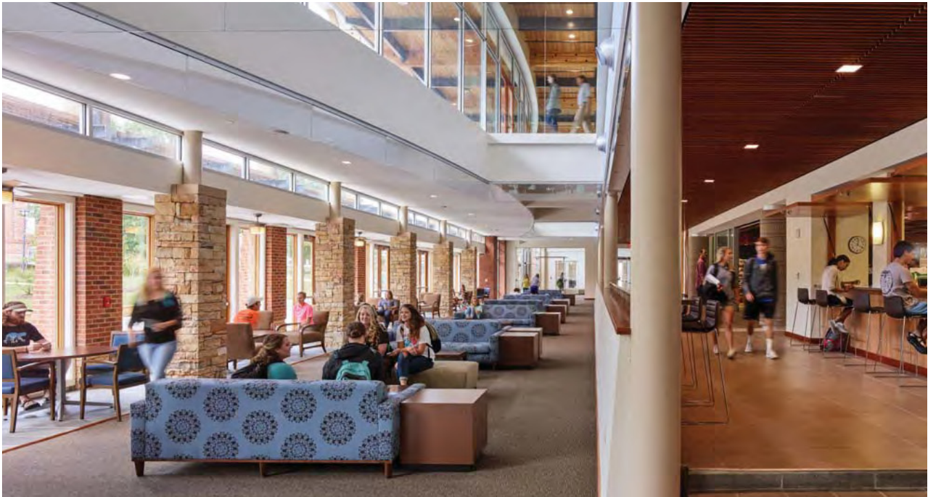
Campus Commons: View from Library Entry with Dining / Bistro to right and Campus Porch above