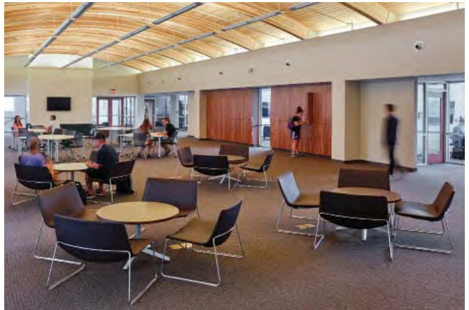
Student Organizations: Activity Loft

Co-locating and cross-training library, campus life, and student development staff brings program synergy to life. This overlap translates into a more efficient building—with fewer spaces than if built separately—concentrating and amplifying the sense of activity around learning outside the classroom. In fact, the number of students using the library has increased by nearly 80% since opening.