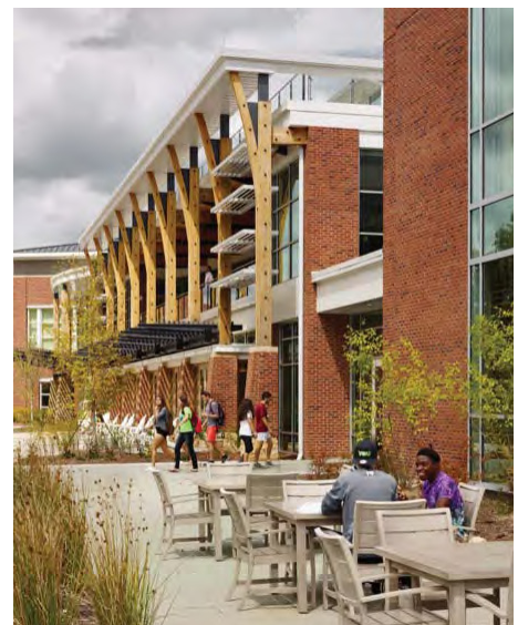
Terrace at Library Entry / Commons Porch

When it comes to spaces for informal social gathering and study, the modern campus library, student union, and dining hall all share remarkable similarities. Each building type promotes interaction and collaboration in a variety of settings, encourages students to meet, interact, and learn, all with access to technology—while being flexible, adaptable, and responsive to rapidly changing digital resources.