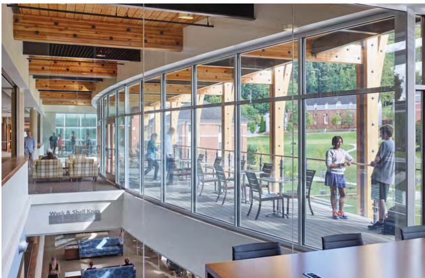
Campus Porch with Commons below / Academic Meeting Classrooms to the left