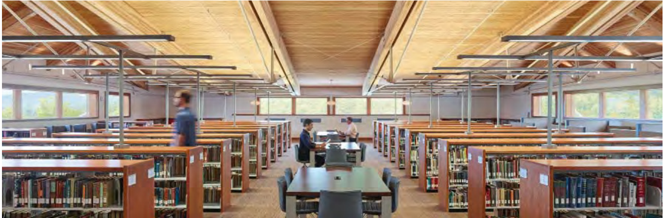
Library: Quiet Study Attic with mountain views on the Third Floor