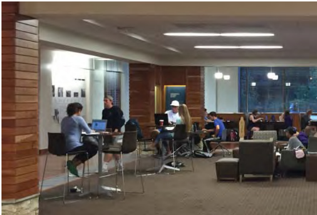
Late Night study in the Library 24-Hour Zone